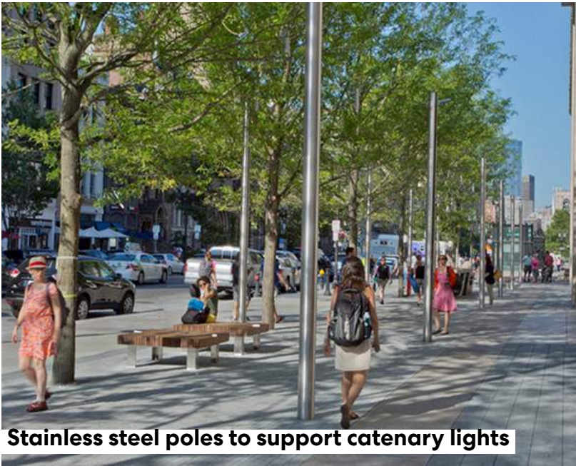
Stainless steel poles to support catenary lights