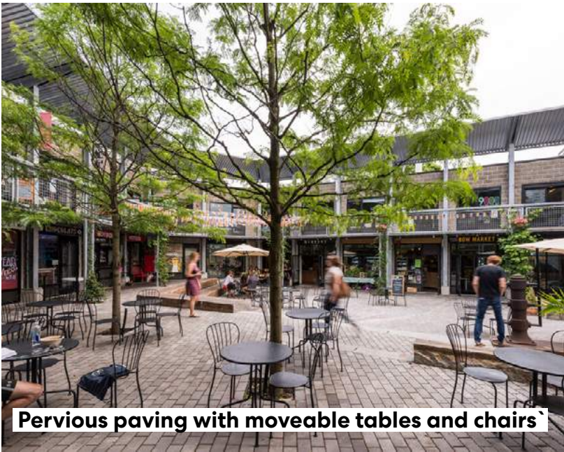
Pervious paving with moveable tables and chairs