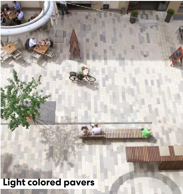
Light colored pavers