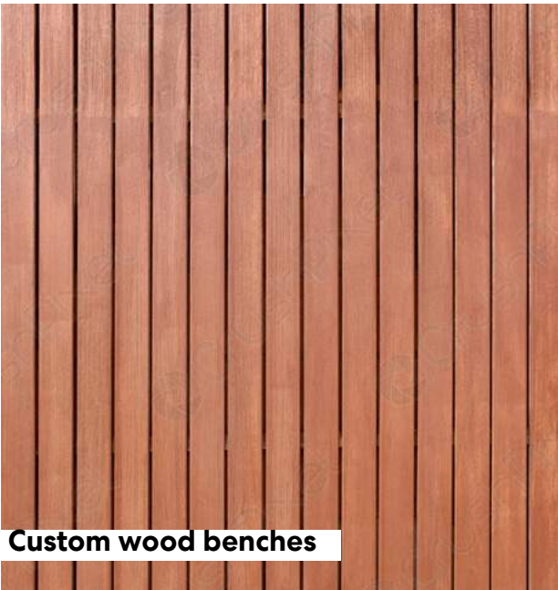
Custom wood benches