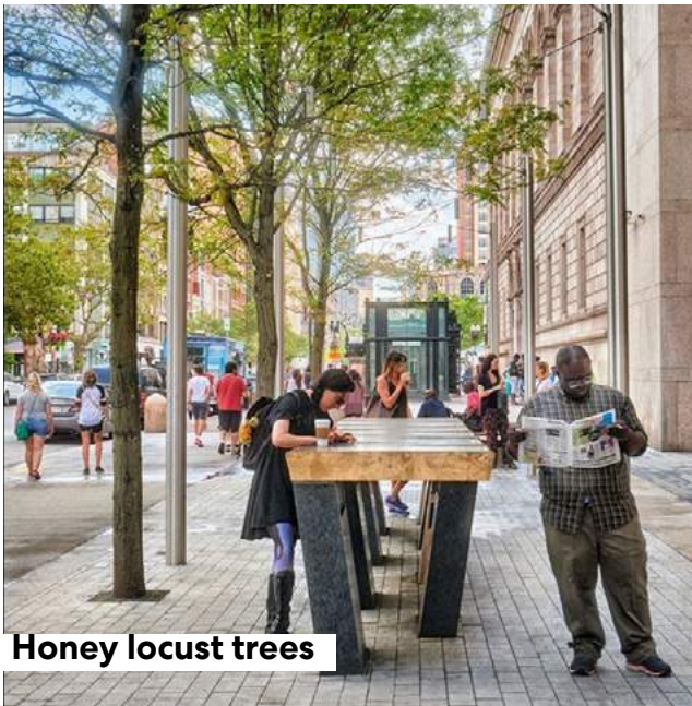
Honey locust trees